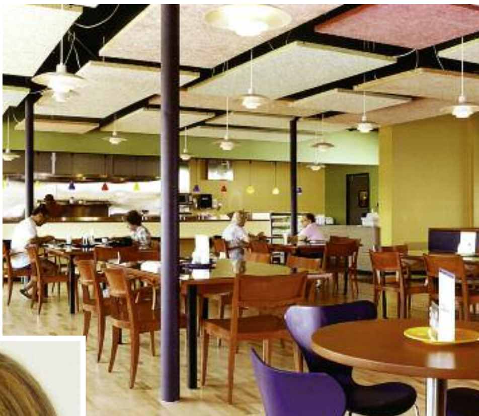
Betsie Sassen (left) says customers come to the café to connect with friends.

Designed to attract people of all ages within the community but geared particularly to those 55 and older, the cafés allow older persons to socialize, learn new skills and interact with one other, says Cara Baldwin, assis-