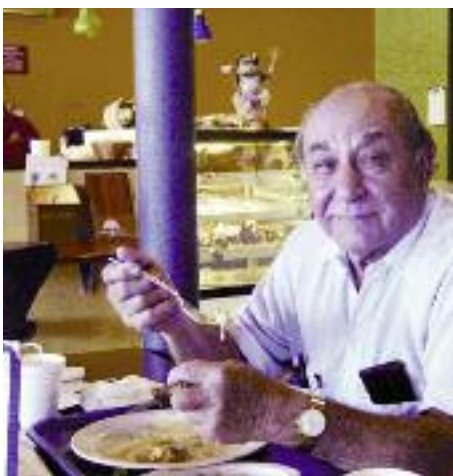
Breakfast served all day is a big café draw.

‘The café serves as the key to get them in the door to see our programs.’