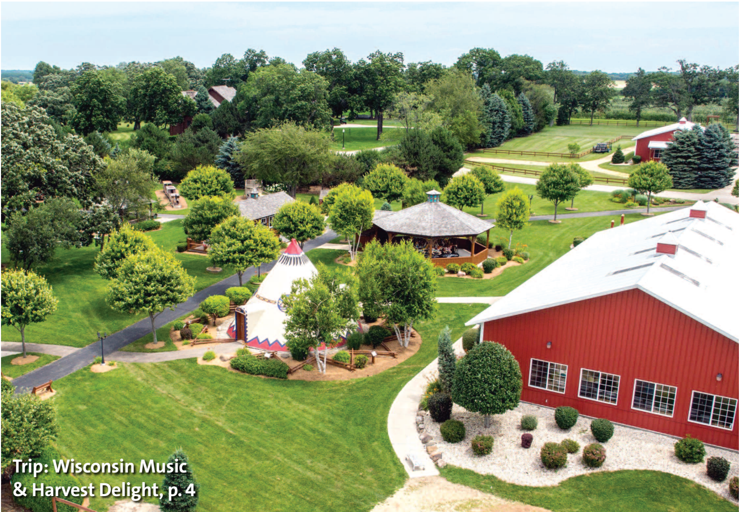
Trip: Wisconsin Music & Harvest Delight, p. 4