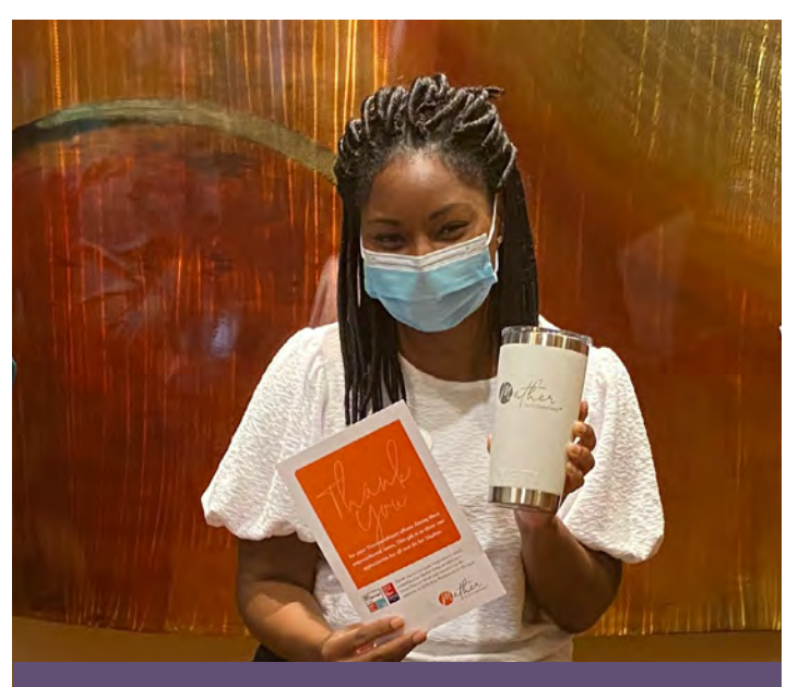
In recognition of all their hard work, Mather employees received tokens of appreciation and a collaborative Be Nextraordinary<sup>TM</sup> playlist to energize and brighten their mood.