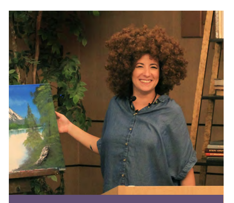
Splendido art classes moved online, with unique offerings like "Painting with Bob Ross."