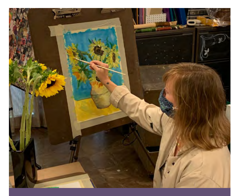
Mather Place residents had art supplies delivered to their doors so they could participate in online classes.