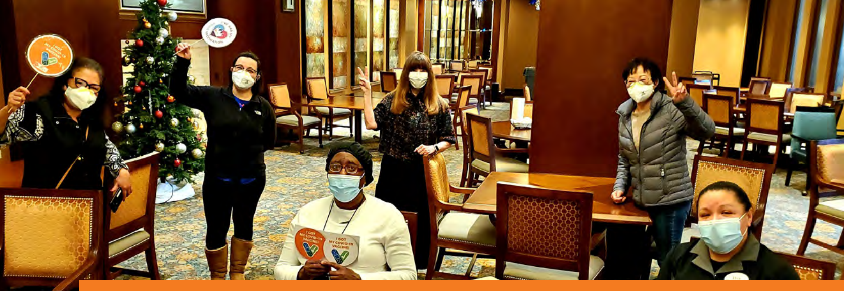
To keep our communities healthy, Mather began distributing COVID-19 vaccines to employees and residents beginning in early January.