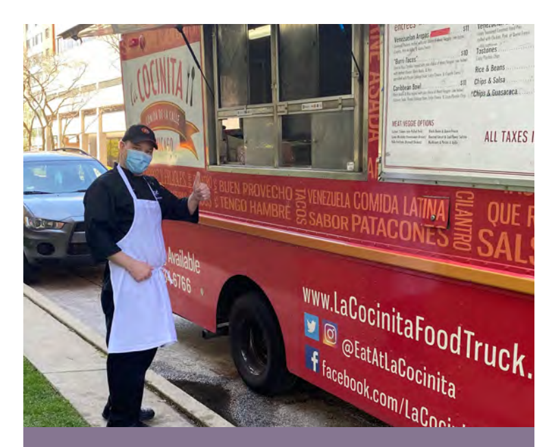
To refuel those who fuel others and support the communities around our own, employees at The Mather in Evanston enjoyed lunch from a local food truck.