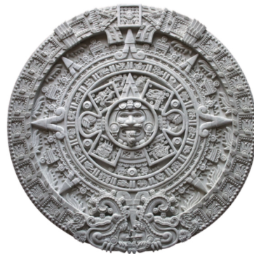
AZTEC SACRED CALENDAR