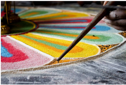
TIBETAN SAND MANDALAS

WE FIND MANDALA TYPE IMAGERY IN CULTURES ALL AROUND THE WORLD.