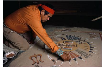
NAVAJO "SAND PAINTING" MANDALAS