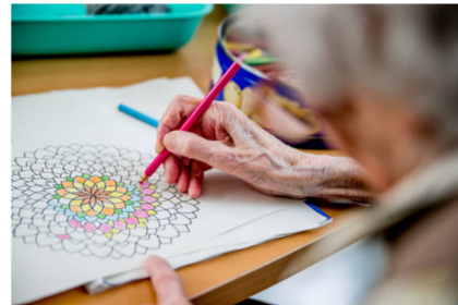
ADULT COLORING BOOKS